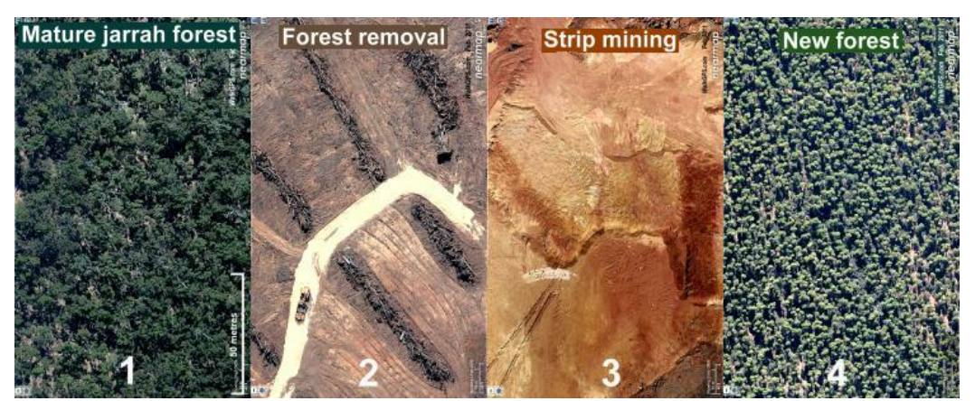
From old forest to new: The mining cycle]

ALCOA is a much-respected corporate citizen and major W.A. employer; it is a sponsor of many worthy community projects and of environmental research; and it has built considerable expertise in restoring the landscape and establishing new young jarrah forest on the mined areas. Worsley will also no doubt build new expertise for their own special challenge of re-establishing wandoo woodlands as its operations expand along the eastern area of the Darling Range.