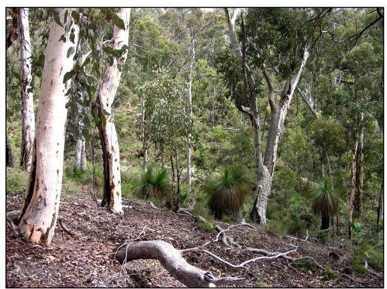
Wandoo woodland on the slopes of a laterite 'breakaway' at Bannister Hill

It comes as a surprise and a shock to many bushwalkers to learn that in fact much of the northern Darling Range across the jarrah forests and wandoo woodlands, including many of the areas we regularly walk outside of the National Parks, is destined eventually to be strip-mined for bauxite. The affected bushwalking areas will stretch from Bannister Hill in the south to beyond Mt Dale in the north. The low-grade bauxite ore which produces alumina is recovered from below the thin (1-2m), laterite caprock that covers most of the hill-tops and low ridges across the Darling Range, including Bannister Hill. The mature forest and the laterite 'pods', with their bounding 'breakaway' landscape, are removed and then 'rehabilitated' after mining with the beginnings of a young replacement forest on the restored topsoil. The mined areas expand at a rate of around 9.3 sq km per year.