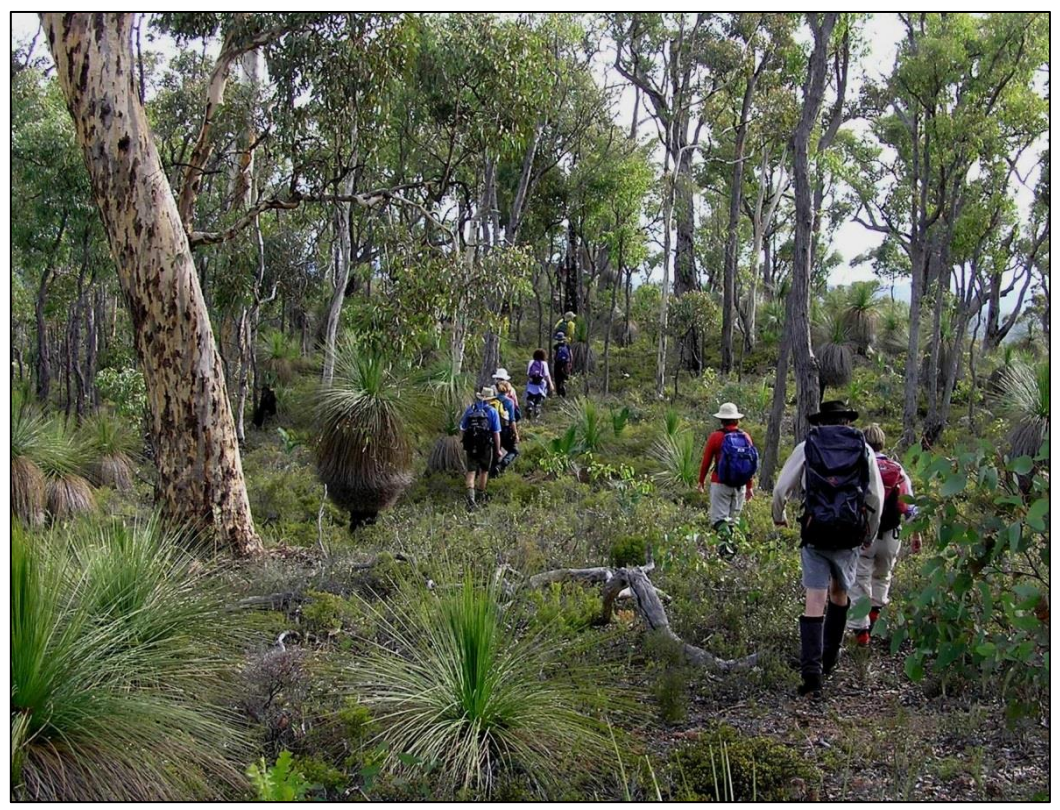
Off-track walkers on laterite-capped Bannister Hill

As Perth's population continues to grow, there will be growing community pressure for access to the nearby Darling Range for more quality bushwalking opportunities beyond the Bibbulmun Track and the National Parks. If we are sufficiently proactive in the ways I suggest above, perhaps walkers in generations to come will be more likely to find that walking in some of the rehabilitated areas once again does become an enjoyable - albeit changed - experience.