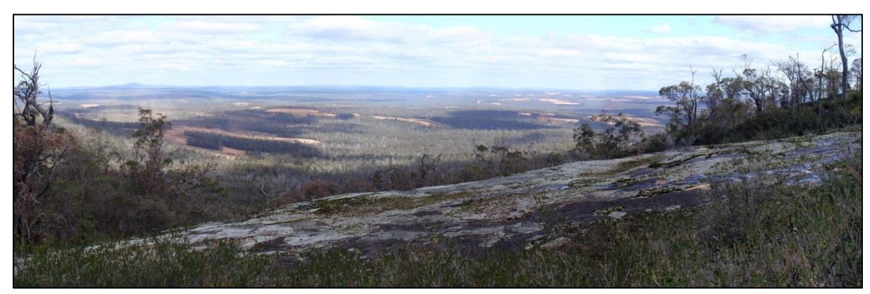
A view from Mount Solus across the encroaching bauxite strip-mining

bauxite mining operations encroaching high around the slopes of distant Mount Solus, another favourite bushwalking area, where similar groans have recently been heard.