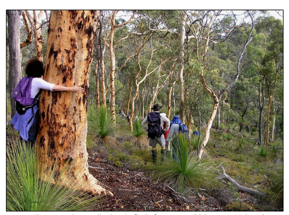
Walkers in wandoo woodland on the flank of Bannister Hill

Most local bushwalkers in Perth, Western Australia know the 'monadnocks' area well. It lies only 55-80 km southeast of the city. A popular section of the long-distance Bibbulmun Track passes through the area, and walkers exploring the granite outcrops around the summits of several 'Mounts' (Cuthbert, Vincent, Randall and Cooke) and the striking, bald dome of Boonerring Hill, are rewarded with expansive views across the forested Darling Range. The laterite-capped Bannister Hill, also flanked by granite outcrops, lies further south down Albany Highway, in a State Forest area, outside the Monadnocks National Park. It is more remote from the Bibbulmun Track and is much less known, though it has also long been popular with off-track walkers; the Perth Bushwalkers Club leads a walk there most years. Due to its varied natural habitat the whole area was once designated as a future key conservation area (the proposed Gyngoorda Conservation Reserve).